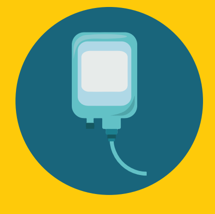
Used Drain/ Urine bags