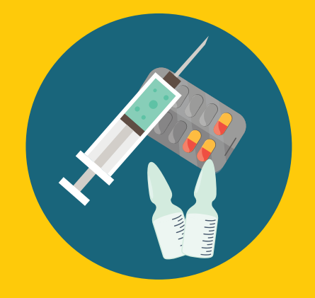
Used syringes/medicines empty ampoules