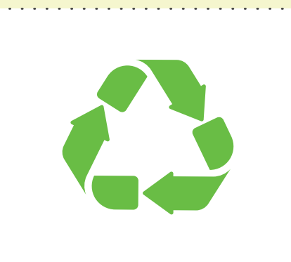
Improves recycle potential