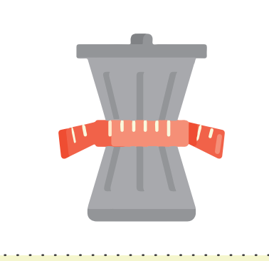
Reduces a lot of processing waste