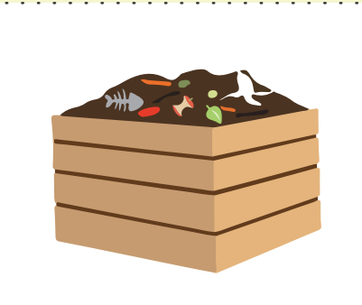
Enables compositing which helps in enriching the soil